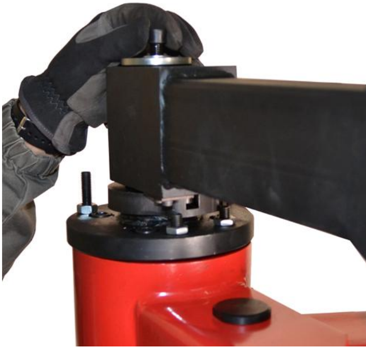
Assist Arm with top bolt and washer

Disconnect the air source from the tire changer and let the air exhaust from the machine. Hook up the air line using the supplied splitter. The airline will be installed by disconnecting the line to the left of the oiler and reinstalling into the splitter (see picture below). Using air after the oiler will allow the assist arm to be lubricated while in use. Secure air lines away from obstructions.