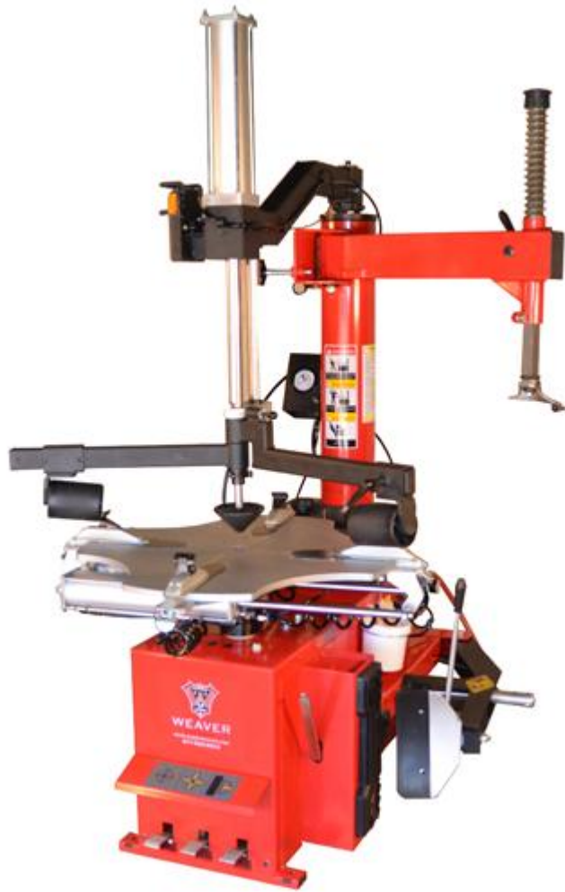
W-PL240 Bead Assist Arm Installed on W-898XS Tire Changer