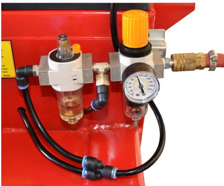
Airline and splitter hookup

Disconnect the air source from the tire changer and let the air exhaust from the machine. Hook up the air line using the supplied splitter. The airline will be installed by disconnecting the line to the left of the oiler and reinstalling into the splitter (see picture below). Using air after the oiler will allow the assist arm to be lubricated while in use. Secure air lines away from obstructions.