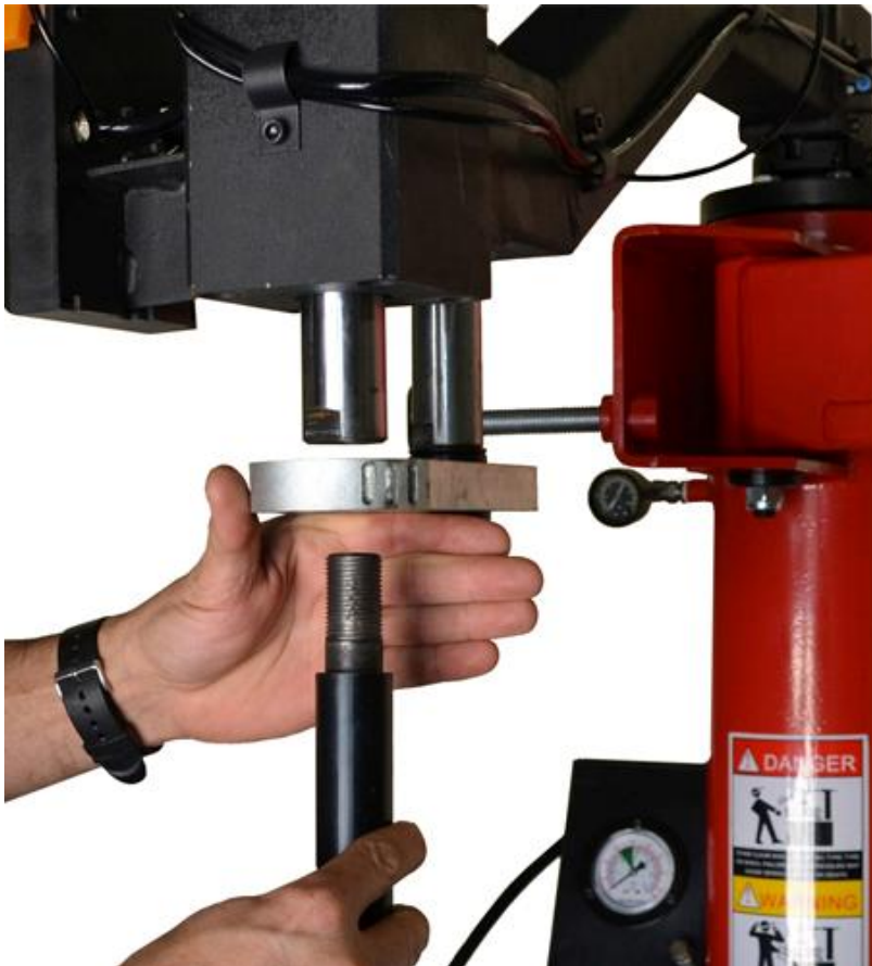
Removing Center Shaft

Recheck that all is centered and tightened. Next attach the roller arms to the center pin by removing the center shaft.