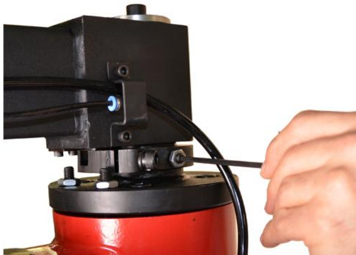
Tightening Jam Bolts on Collar

Recheck that all is centered and tightened. Next attach the roller arms to the center pin by removing the center shaft.