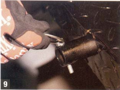
9 ...there are pin-clips that keep the tubes in place.