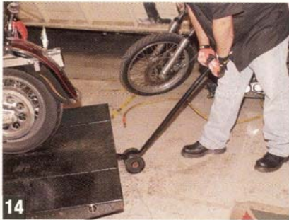
14 If the lift needs to be moved around, it comes with this cool wheel-dolly that has a fitting that connects to the back of the lift. This allows the lift to roll around without having to lift it, making it easy to move out of the way if needed.