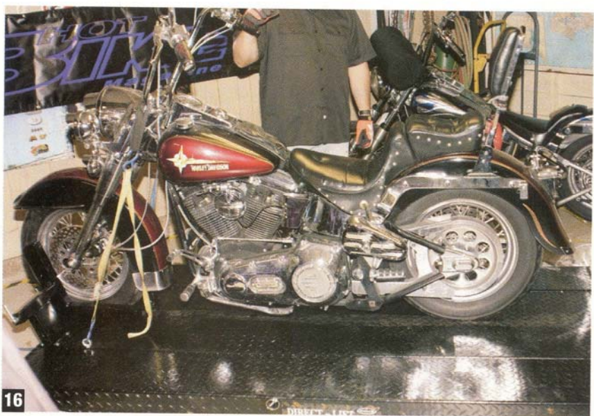
16 This is the perfect lift for the pro shop and home shop.