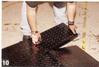
10 The extensions also have ramps for both sides, with holes for the tabs to drop into and keep them in place, even when the lift is up in the air.